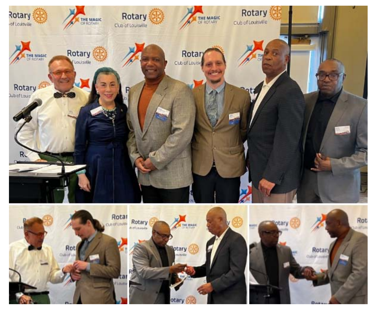
Click Read More to read the introductions: Read More